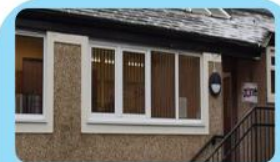
Clitheroe Family Hub Wesleyan Row Parsons Lane BB7 2JY