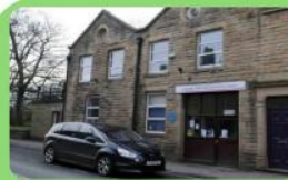
Longridge Family Hub Berry Lane Longridge PR3 3JP