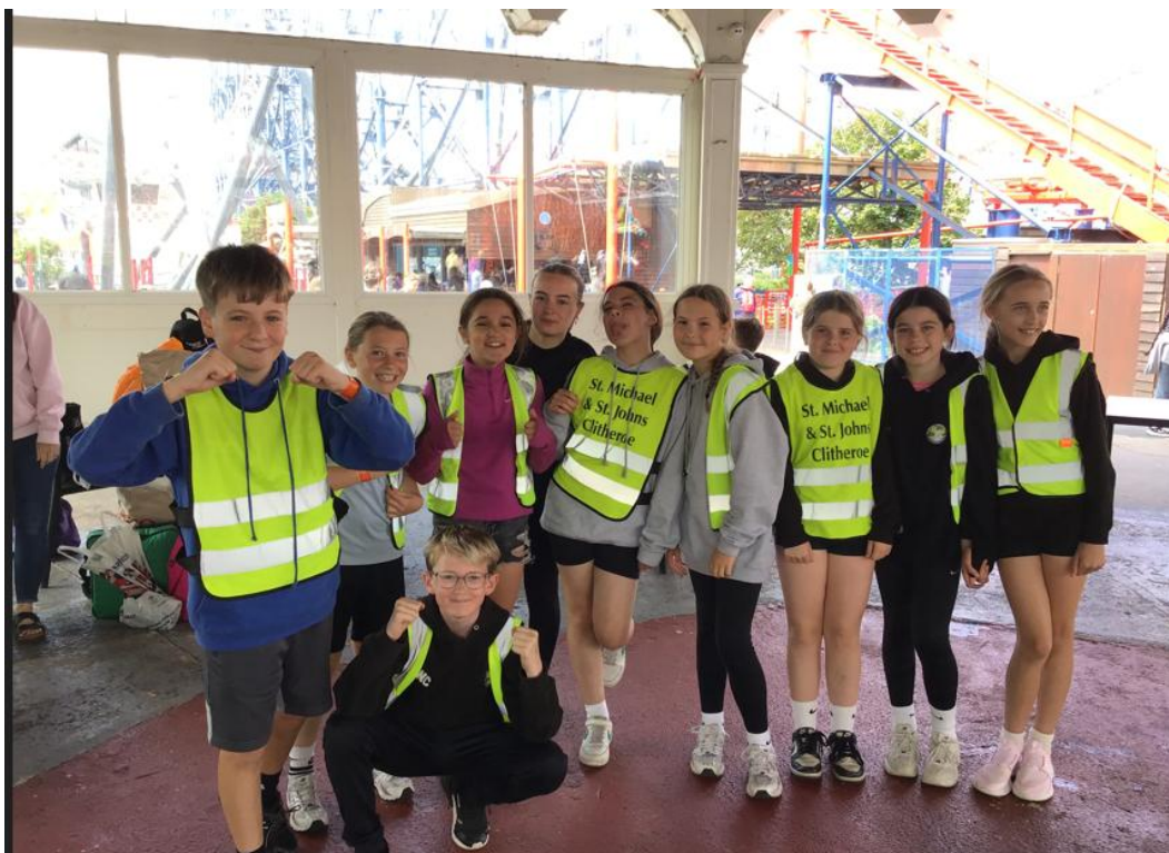
Celebrations after riding the Big One!